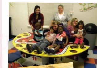
Monday Night, Children's Life Skills

Since the beginning of January, the Lord put two of the most amazing kids into my life. I have had the privilege of tutoring two of the older children once a week and getting to talk about things that are going on in their lives. I have learned so much about them and have developed strong relationships with both of them. Simple things like filling baskets with fun things that they enjoy, and watching their reaction when they open it is priceless.